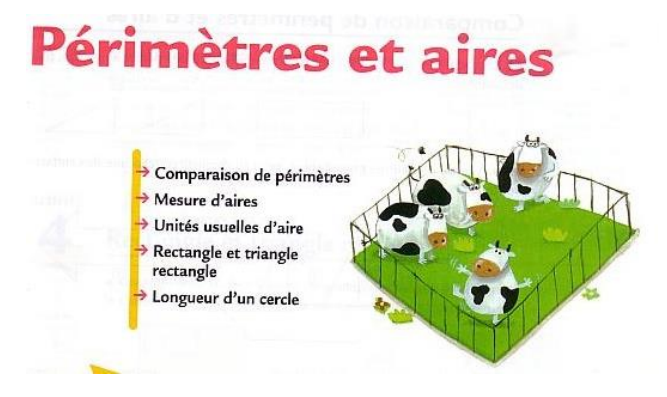
An humoristic illustration (transmath textbook 2000, p 175)

An engraving representing a roman steelyard (Leyssenne, 1896, p168)