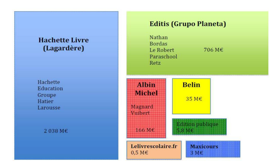
Figure 1. Major publishing houses in the school sector

The paper textbook is still a very profitable business. According to IGEN (2013), the market structure of private educational publishers is that of an "oligopoly fringe", the sector is characterized by a high concentration. Figure 1 presents the current situation; the name of the companies and the names of know French publishers.